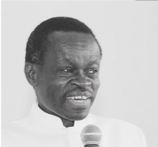
Professor PLO Lumumba

Professor PLO Lumumba is the Founder of the PLO Lumumba Foundation and a consultant with Lumumba and Lumumba Advocates, a member of the Africa Justice Group (AJG). He is an Advocate of the High Courts of Kenya and Tanganyika and a certified mediator. He is a Fellow of the Institute of Certified Public Secretaries of Kenya FCPS (K), a Fellow of the Kenya Institute of Management (FKIM), and an Honorary Fellow of the African Academy of Sciences (FAAS). He is the Chairman of Farafina Investment Group in Monrovia, Liberia, and Economic Strategic Growth and Development Initiative for Africa is based in Nigeria.